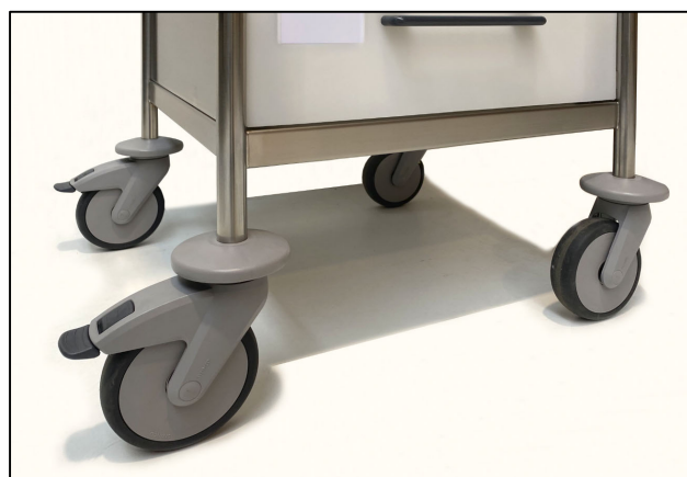
WS12 - Ø 125 mm SIMPLE WHEELS 2 ANTISTATIC, 2 WITH BRAKE